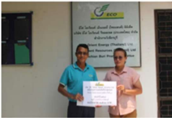
On 5 Apr'24, Futsal Sports of Moo 9, Tha Rong Sub district, Wichianburi