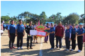
On 20 Dec'23, participated in sport activity of Bor Rang Education Development Center, Wichianburi District and provided fund support to this activity.