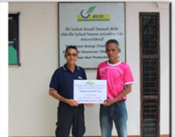
On 12 Mar'24, funding football Sports of Teacher Summer Cup, Wichianburi