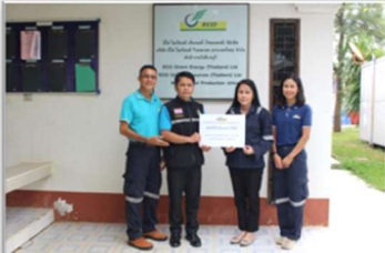
On 21 Jul'23, provided budget support sports of public relations, "Masses Football Game of Wachian Buri District"