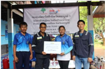
On 6 Oct'23, provided budget support Banchatsal School, Si Thep District where is located surrounding NSE-K Well Site to organize School Sport activity.