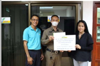
On 24 Nov'23, provided budget support to Wichianburi Police Station for organize annual sport activity.