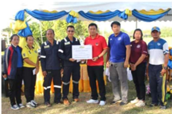
On 1 Dec'23, provided budget support Ban Tong Yai school, Wichianburi District to organize School Sport Activity.