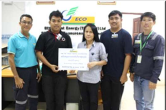
On 1 Nov'23, provided budget support to Ban Na Takrud, Srithep District for organize sport activity