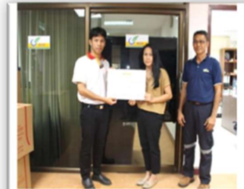
On 2 Jan'24, funding support Badminton Sport Club of Wichainburi