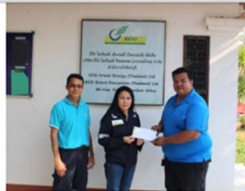
On 26 Jan'24, funding support Volleyball Sport activity of Wichainburi District