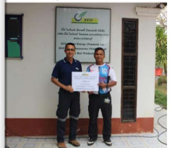
On 12 Mar'24, football sport of Ratchasri games of Village Headman Club.