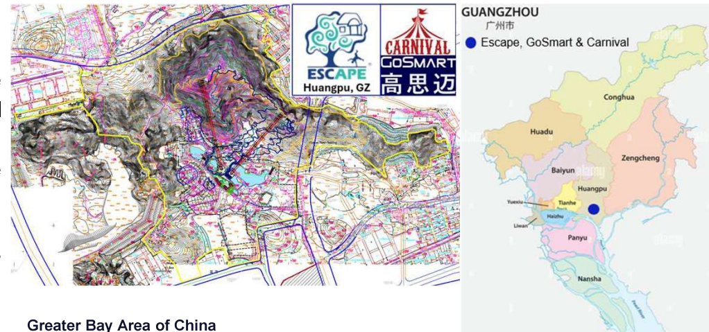
Greater Bay Area of China (Within 2-hour drive radius – ESCAPE Huangpu)