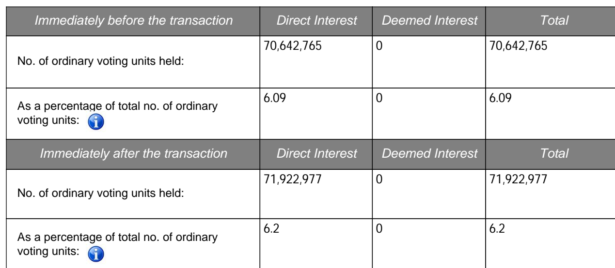
Table 1. Change in respect of ordinary voting units of Listed Issuer