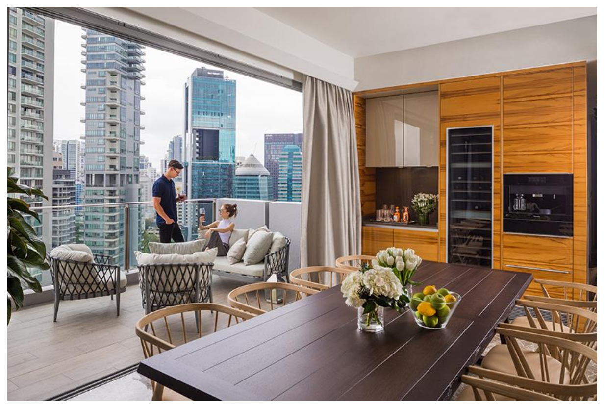
Fraser Residence Orchard, Singapore

Frasers Hospitality pushes into Singapore's luxury serviced residence space as it opens its fifth property in the city state