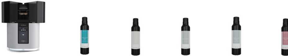
3D Technology and Resins that supports High-Speed Printing