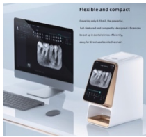
Radiography Imaging System