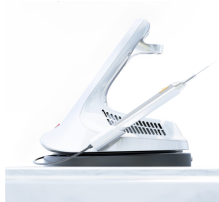
Laser Therapy Technology