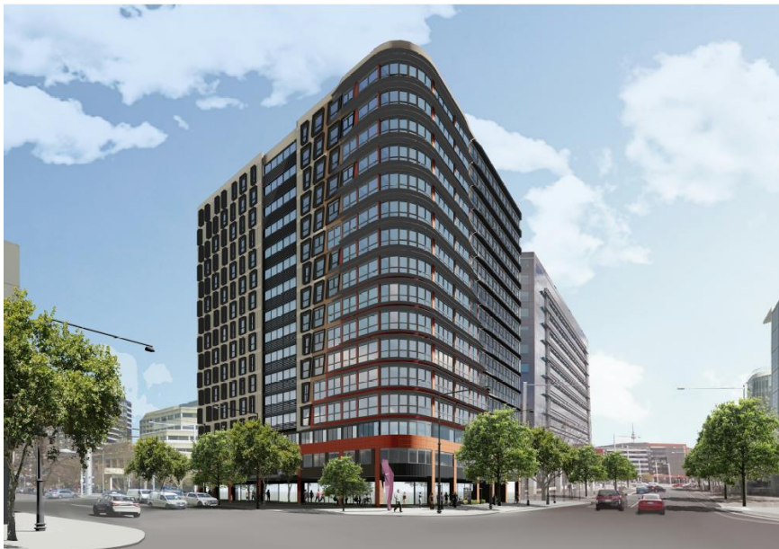
Y Suites on Moore