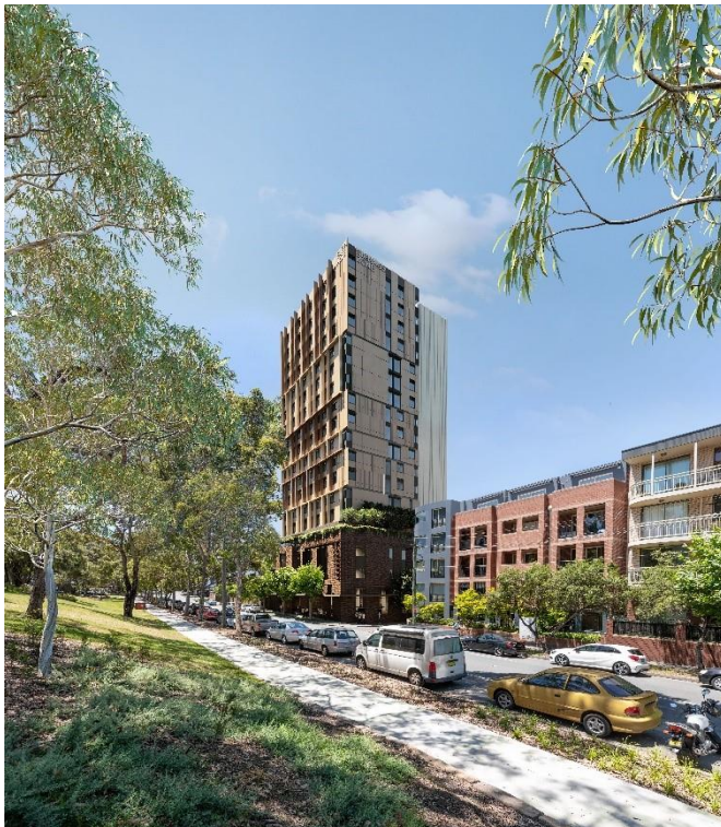
Y Suites on Gibbons