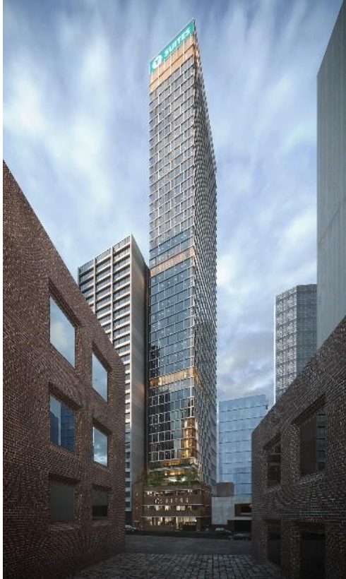
Y Suites on A'Beckett

For the remaining 4 PBSAs, one is currently under construction in Melbourne (888 rooms). The remaining two in Sydney (total 827 rooms) and one in Canberra (733 rooms) are pending Development Approval. The 4 PBSAs are scheduled to be operational between 2022 and 2023.