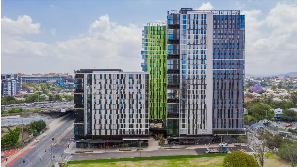
UniLodge Park Central

The two operational PBSAs, namely UniLodge Park Central at Brisbane with 1,578 rooms and UniLodge City Gardens in Adelaide with 772 rooms, are currently operating under UniLodge branding with UniLodge property management. Arrangement has been made for the two PBSAs to operate under Y Suites in 2021 with UniLodge continuing with property management.