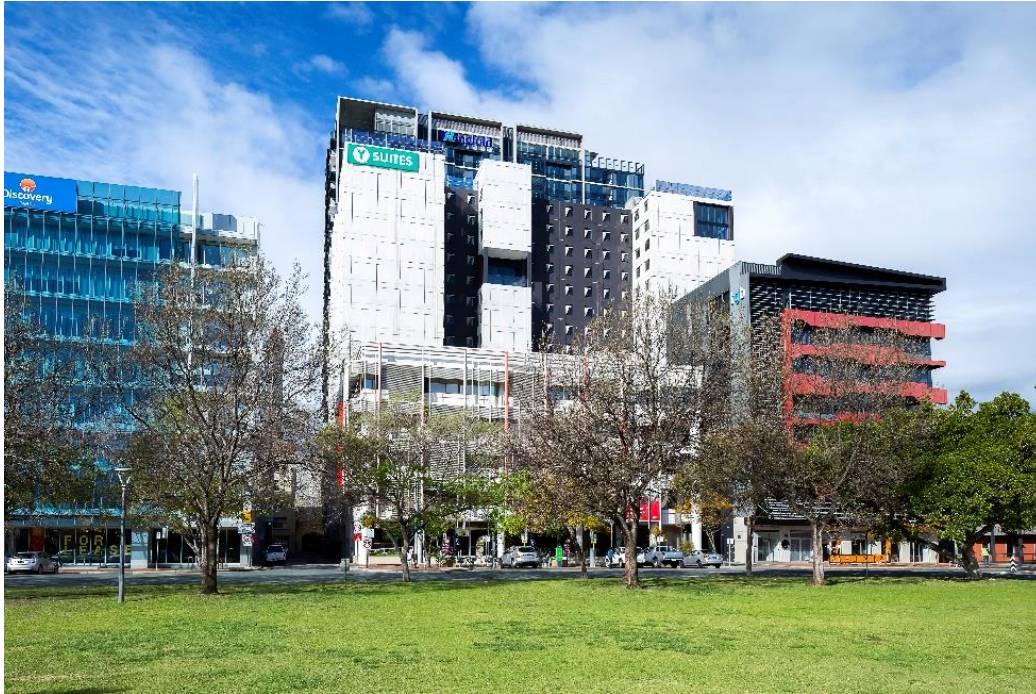
Y Suites on Waymouth

Y Suites symbolises the intersection between ideas, people and cultures, drawing upon the best of the community to deliver an exceptional student experience. The first property to be launched under the new brand, Y Suites on Waymouth at 124 Waymouth Street is Wee Hur's 2 nd PBSA in Adelaide with 811 rooms, will be operational in January 2021.