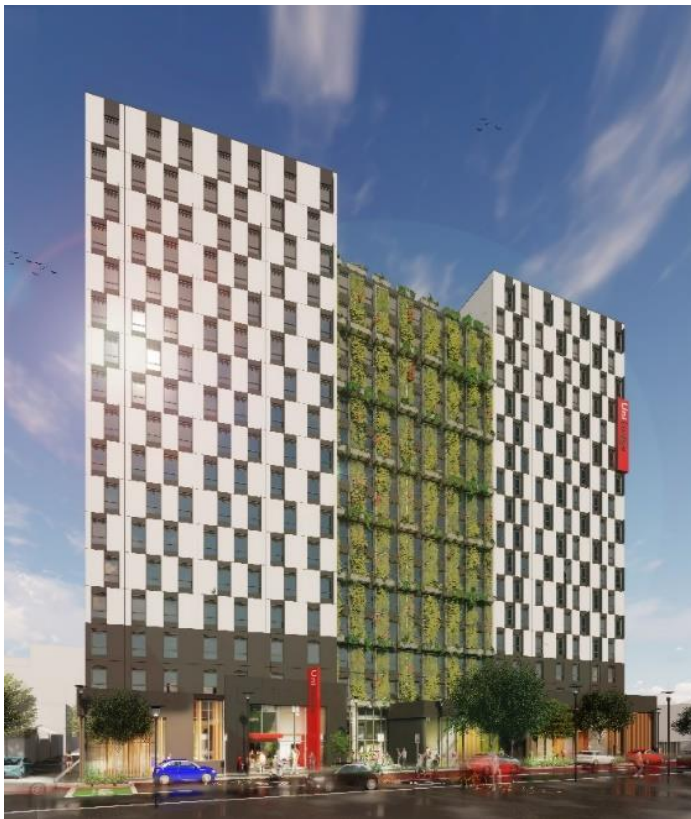
UniLodge City Gardens