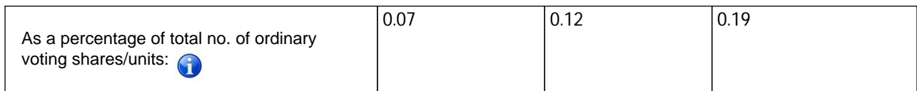
Table 3. Change in respect of rights/options/warrants over shares/units of Listed Issuer