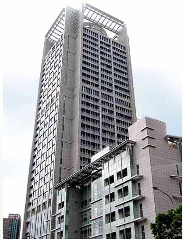
Taiwan Taipei Office

The Group’s main lines of business include manufacturing original products and providing integrated hospital services. As an original product manufacturer (OPM) of a wide range of medical consumables, and hospital and work wear apparels, the Group maintains manufacturing facilities located in the Philippines, China and Cambodia. As a hospital services provider, the Group provides hospitals in Taiwan and the Philippines with integrated services which include rental and laundry of linens, management of laundry facilities, hospital automation and