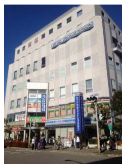
Inage Kaigan Ekimae Building