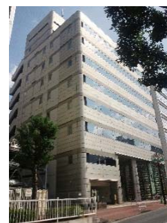
Shinjuku-ku Kabukicho Building

For any query on the announcement, please contact: Tosei Corporation Corporate Planning Department Phone: +81-3-3435-2864