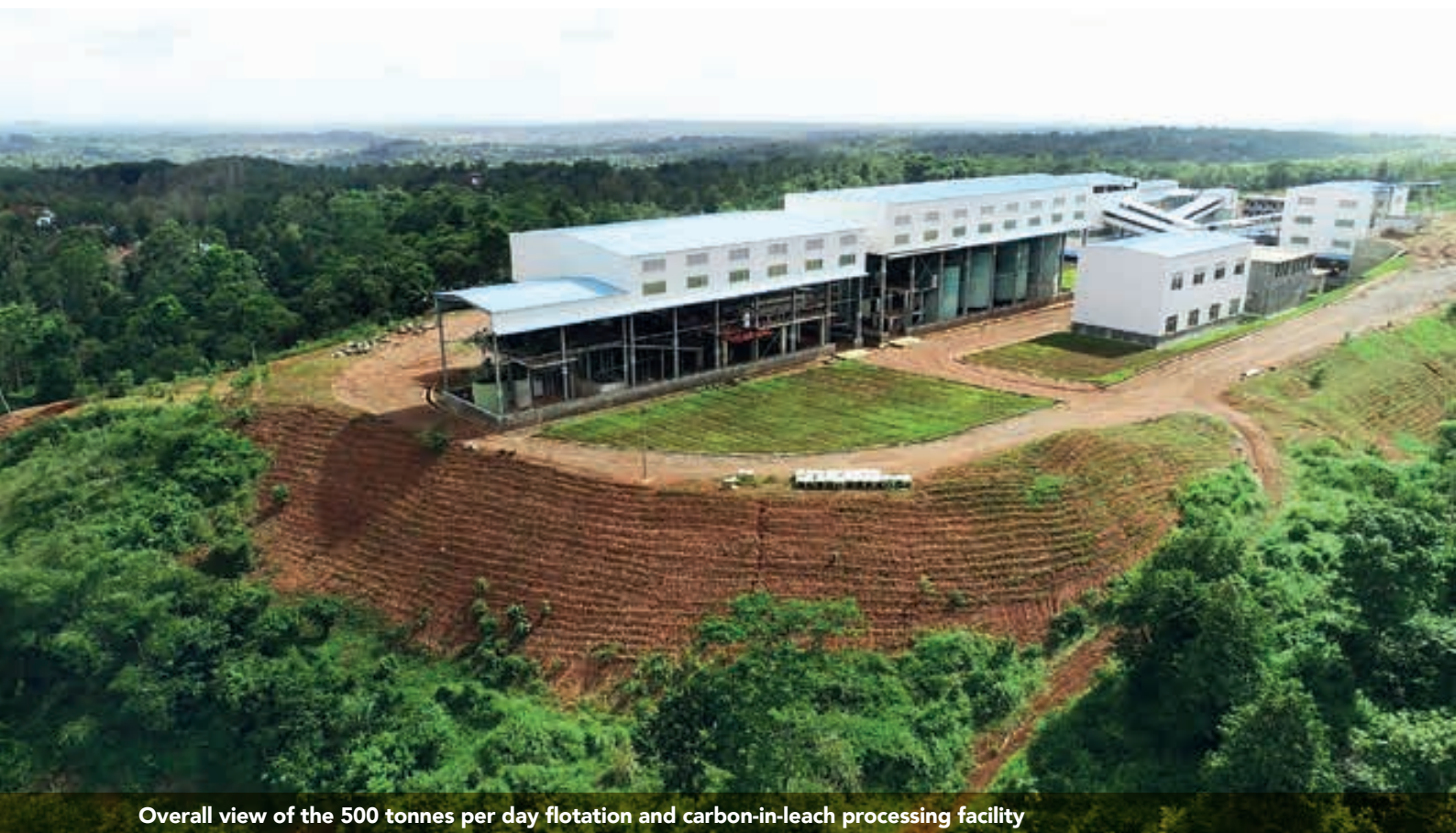
Overall view of the 500 tonnes per day flotation and carbon-in-leach processing facility

Besides seeking to develop gold deposits, the Group is exploring the potential of other mineralised areas of the Ciemas Gold Project to build sustainable value for its stakeholders.