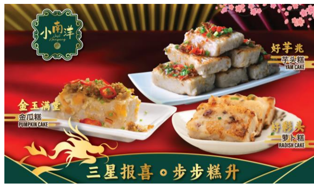
FOOD AND BEVERAGES