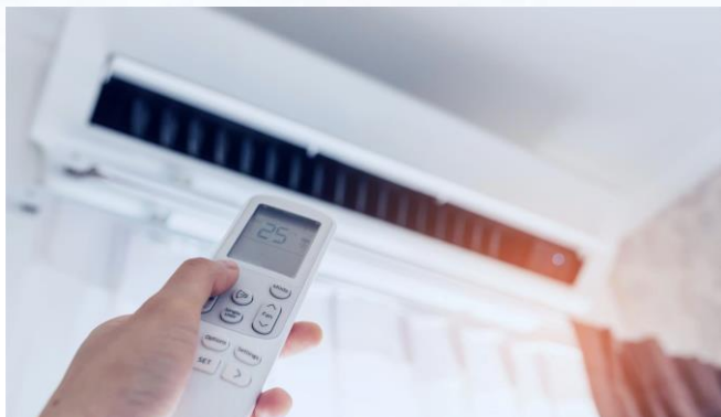
AIRCON AND ENGINEERING