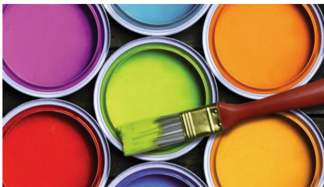
PAINT AND COATINGS

Our Business Segments remained unchanged from the previous financial year end.