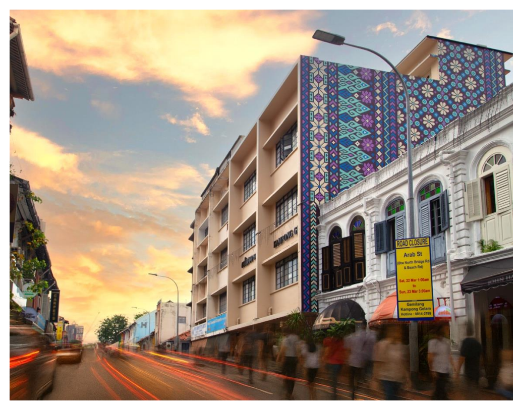
Building exterior of Coliwoo Hotel Kampong Glam, featuring a striking geometric design on the facade inspired by Malay textile compositions and motifs – paying homage to the rich heritage of the district.

Singapore, 15 May 2025 – Coliwoo, a co-living subsidiary brand under real estate management services group, LHN Limited ("LHN", together with its subsidiaries, the "Group"), has launched Coliwoo Hotel Kampong Glam, the latest addition to its growing portfolio of properties across Singapore.