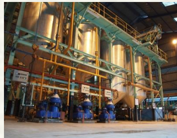
Palm Oil mill

Total Investment for 2015: around IDR 0.97 trillion