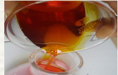
Crude Palm Oil