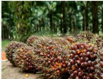
Fresh Fruit Bunches

Total Planted: 164,177 ha (including Plasma) for 31 Dec 2015