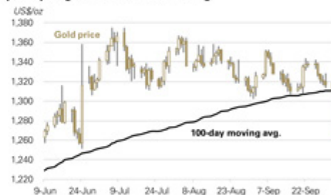
Chart 1: Gold fell below its 100-day moving average prompting further tactical selling

Once the gold price pushed below US$1,310/oz an ounce, representing gold's 100-day moving average, technical selling increased sharply ( Chart 1 ), exacerbating the fall and triggering stop-losses and further tactical selling. Meanwhile, Chinese investors, who have historically bought on dips, were celebrating Golden Week national holiday, leaving domestic markets closed.