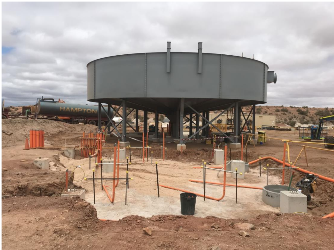
Figure 5 | Thickener