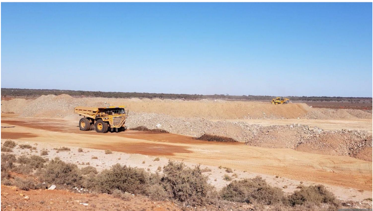
Figure 9 | ROM Pad construction