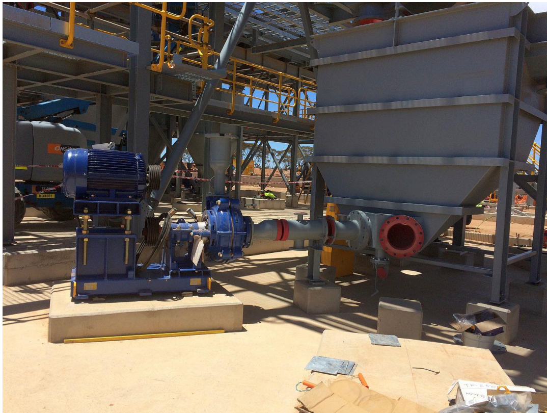
Figure 4 | Pumps being installed