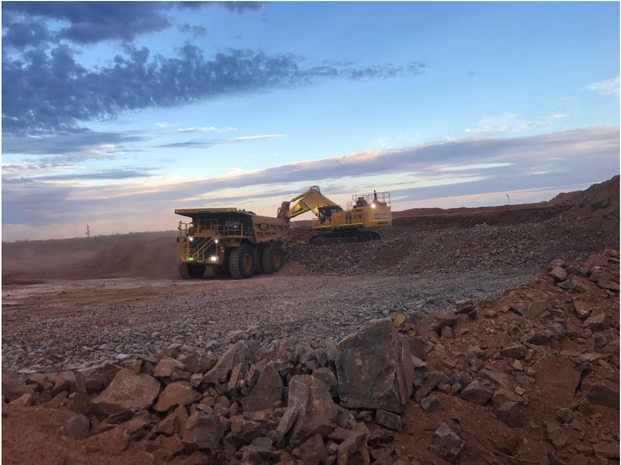
Figure 8 | Removing Waste