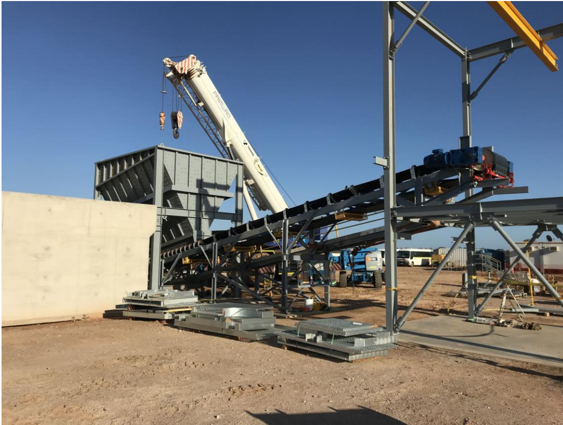
Figure 6 | ROM Feed Bin and Transfer Station