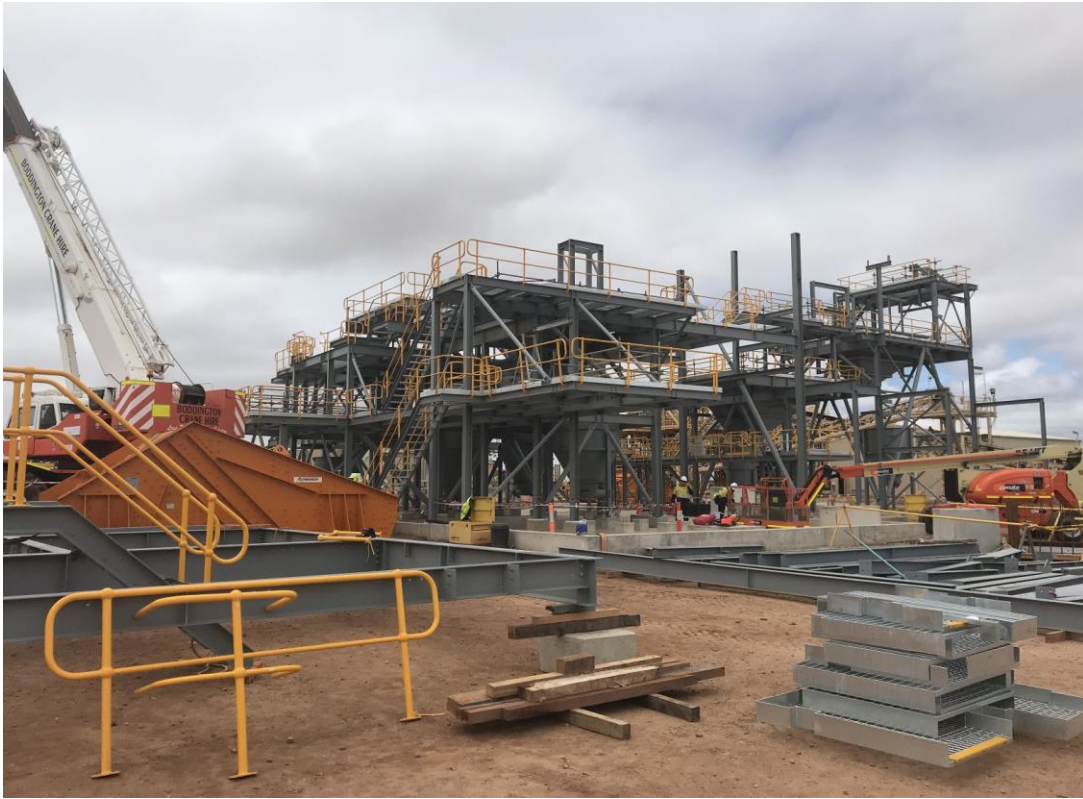
Figure 2 | Structural steel – main DMS building