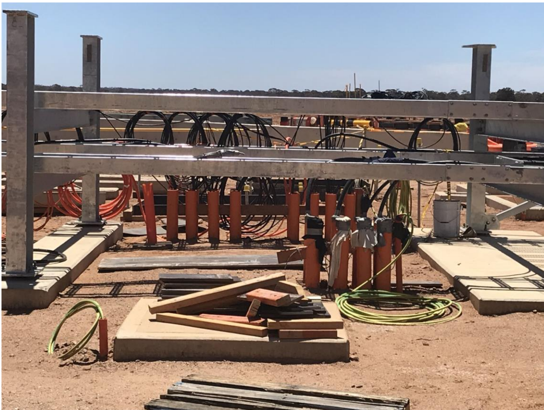
Figure 7 | Electrical Cabling