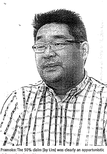
claim and I rejected it

much more money to grow. "When more funds were required, Lim decided that his initial A$7 million investment would be turned into