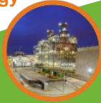
Keppel Merlimau Cogen