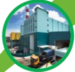
Keppel Seghers Tuas WTE Plant