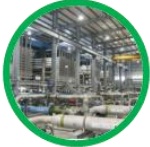
SingSpring Desalination Plant