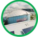
Keppel Seghers Ulu Pandan NEWater Plant