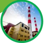
Senoko WTE Plant