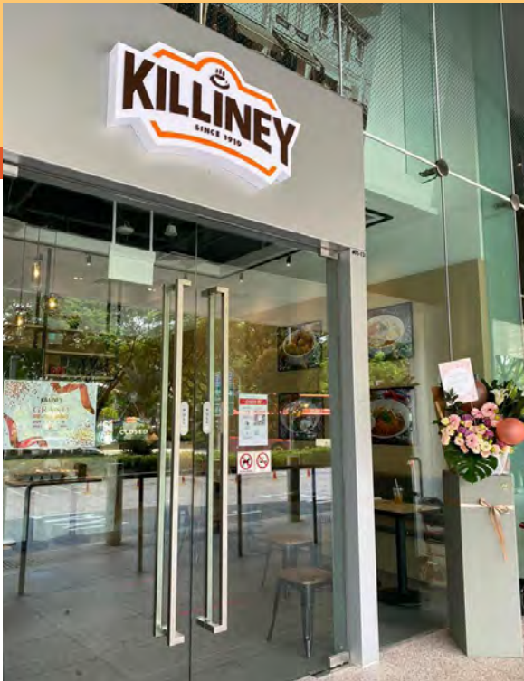
KILLINEY - 9 PENANG ROAD 9 Penang Road #01-13, Singapore 238459