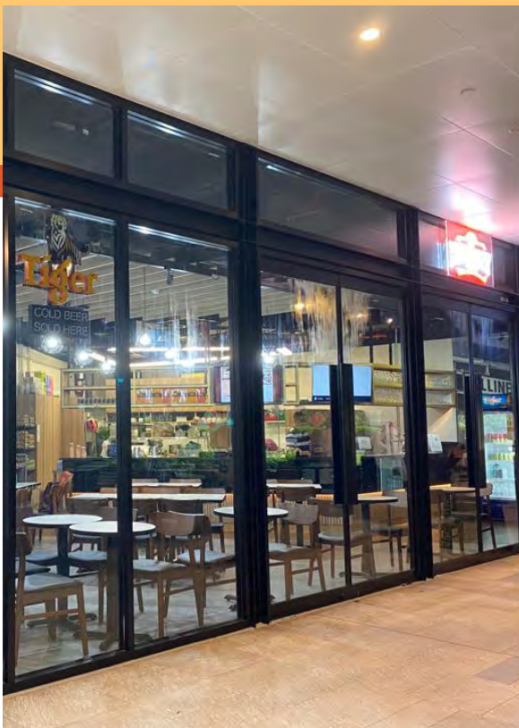
KILLINEY - PLQ3 2 Tanjong Katong Road, PLQ3, #01-10, Singapore 437161