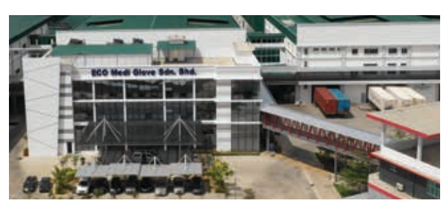
MALAYSIA - TAIPING Eco Medi Glove Sdn Bhd