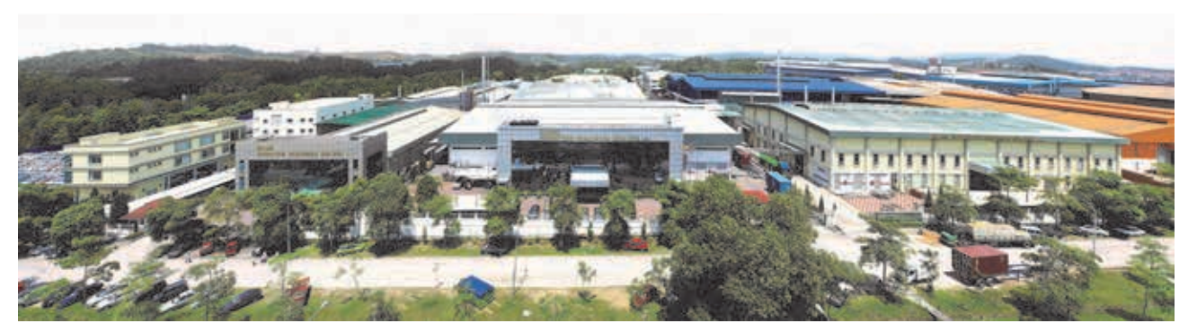
MALAYSIA - HEAD OFFICE Riverstone Resources Sdn Bhd

As a global supplier of Cleanroom Consumables and Healthcare Gloves, currently we have five manufacturing facilities, located in Malaysia, Thailand, China and established network of sales offices and strategic partners in Asia, the Americas and Europe.