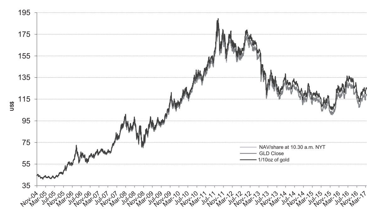
Share price & NAV v. gold price from November 18, 2004 to March 31, 2017

Investing in the Shares does not insulate the investor from certain risks, including price volatility. The following chart illustrates the movement in the price of the Shares and NAV of the Shares against the corresponding gold price (per 1/10 of an oz. of gold) since the day the Shares first began trading on the NYSE: