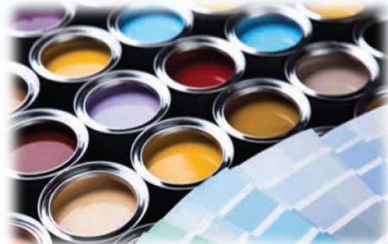
PAINT AND COATINGS