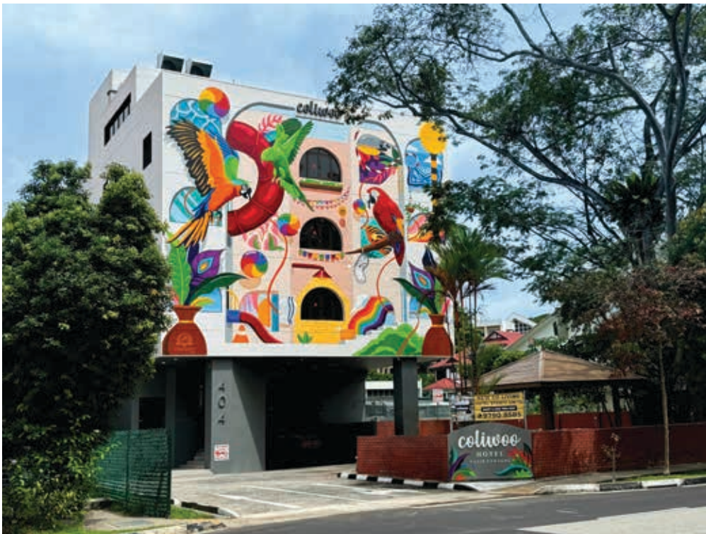
Exterior of Coliwoo Hotel Pasir Panjang, featuring an imaginative mural that injects vibrancy within the neighbourhood of the Pasir Panjang district

Singapore, 18 December 2023 – Coliwoo, a co-living subsidiary brand under real estate management services group, LHN Limited (“LHN”, together with its subsidiaries, the “Group”), has recently unveiled its latest property – Coliwoo Hotel Pasir Panjang – the newest addition to the brand’s portfolio that now sees 15 properties launched islandwide.