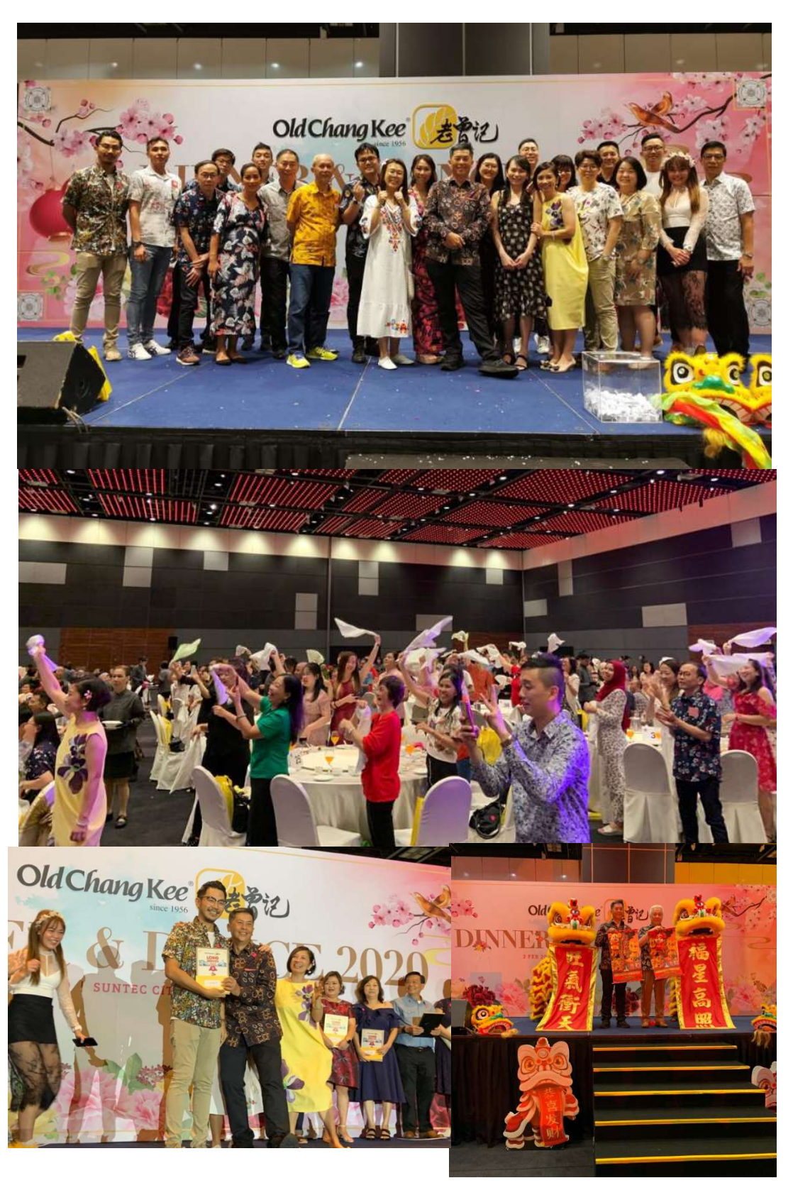
20 Old Chang Kee Ltd. Sustainability Report 2020