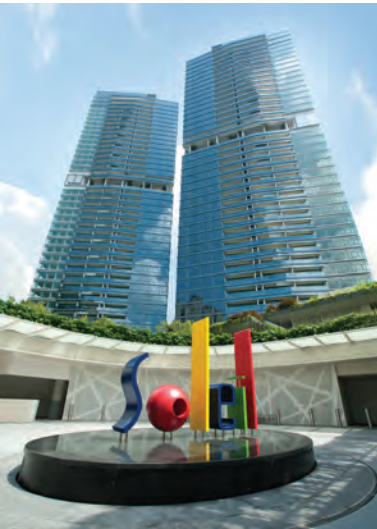
Soleil @ Sinaran, Singapore