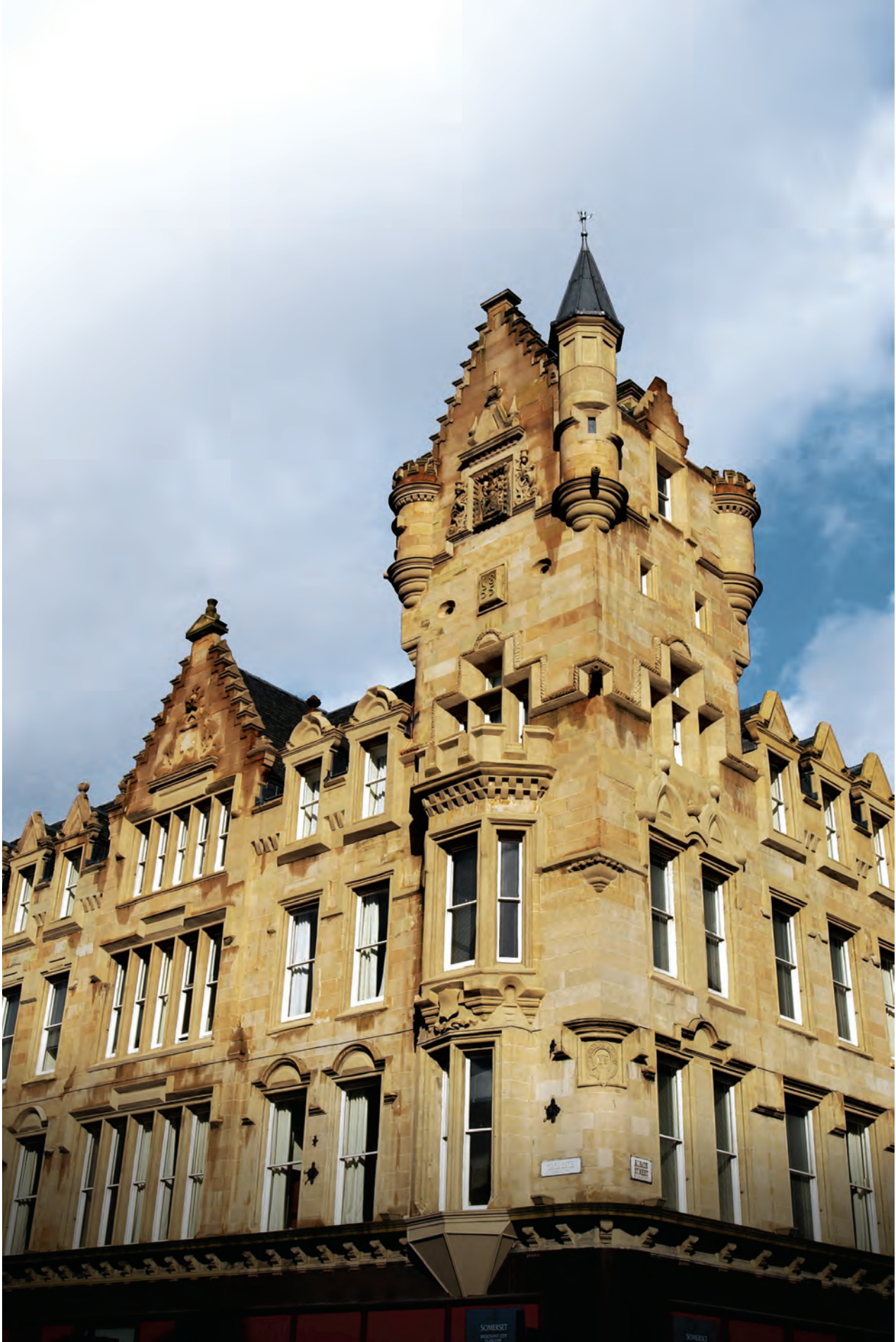
Fraser Suites Glasgow, UK.