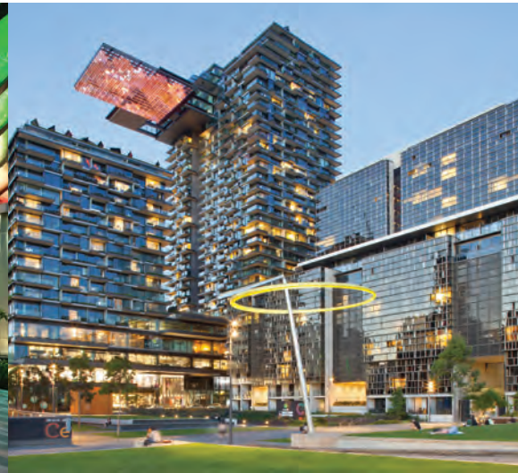
One Central Park, Sydney, Australia