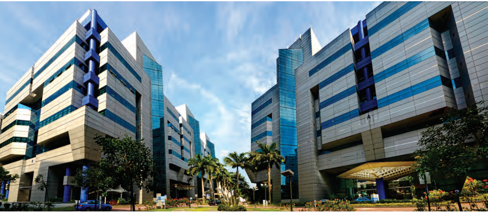
Alexandra Technopark, Singapore.