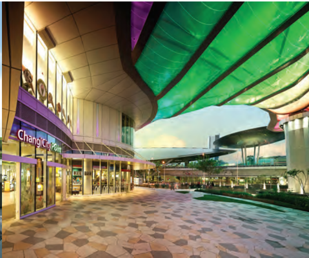
Changi City Point, Singapore