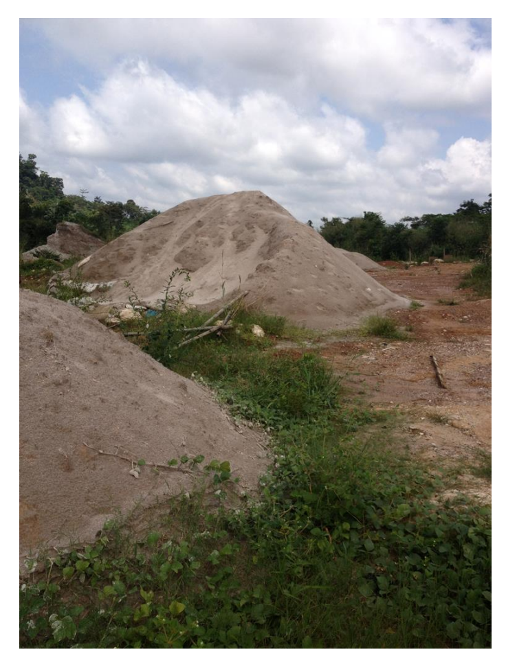
Signature Metals'/Owere Mine's gold production facilities