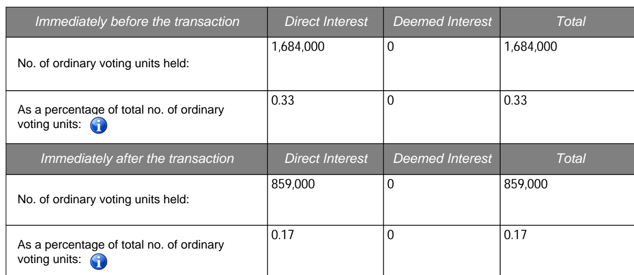
Table 1. Change in respect of ordinary voting units of Listed Issuer