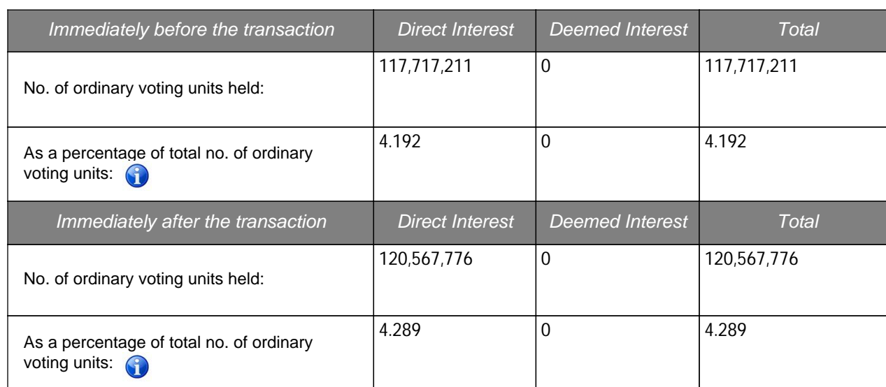
Table 1. Change in respect of ordinary voting units of Listed Issuer