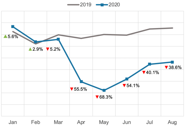
Chart 2b: ARF's Portfolio Shopper Traffic (y-o-y % change)