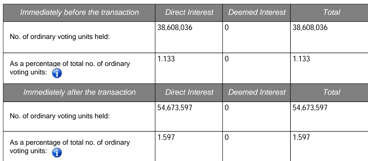
Table 1. Change in respect of ordinary voting units of Listed Issuer