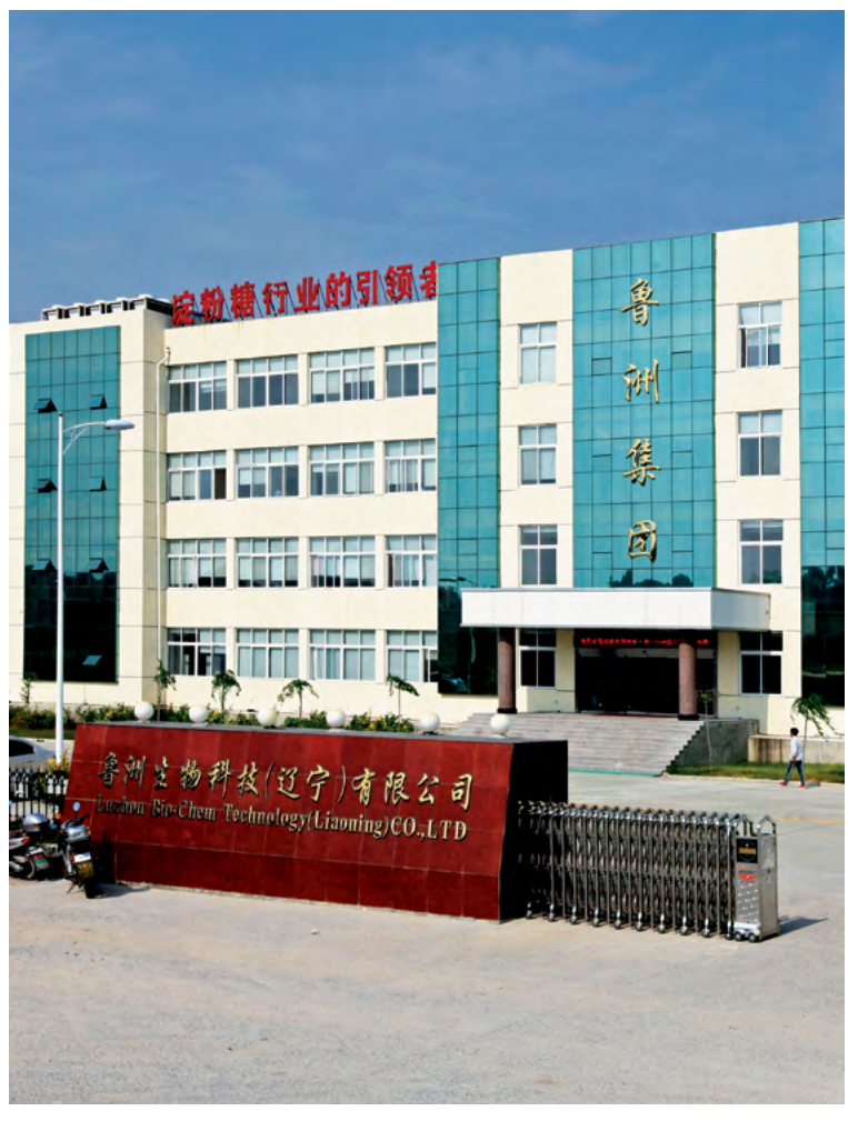
Liaoning plant office building