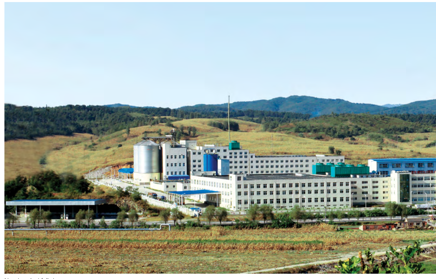
Liaoning plant full view

Owing to the firm competition for corn sweetener products in Liaoning, sales volume and output dipped during the year. In light of this, the Group will consolidate our sales strategy in Liaoning by strengthening our engagement of high value customers for the sales of F55 fructose products, in order to fortify sales and increase production to lower production costs and strengthen profitability. At the same time, we will continue to monitor market conditions and make appropriate adjustments to drive further improvements.