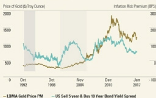
Figure 1: Inflation Risk Premium & Price of Gold Don't Always Move in Lockstep