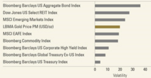
Figure 4: Gold's Volatility Tends to be Lower than Certain Equities

Data from 01/31/07 to 01/31/17 reflect annualized monthly averages for 120 months. Past performance is no guarantee of future results.