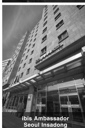
ibis Ambassador Seoul Insadong