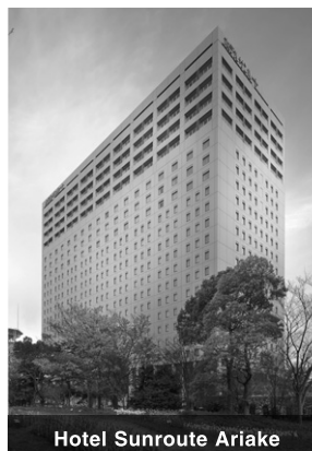
Hotel Sunroute Ariake

19 October 2019 (Saturday) at 11:00 a.m.