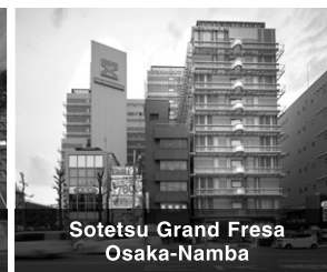
Sotetsu Grand Fresa Osaka-Namba