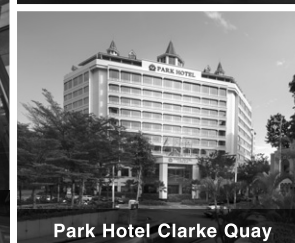
Park Hotel Clarke Quay