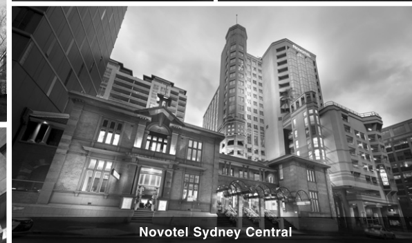
Novotel Sydney Central