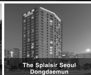
The Splaisir Seoul Dongdaemun