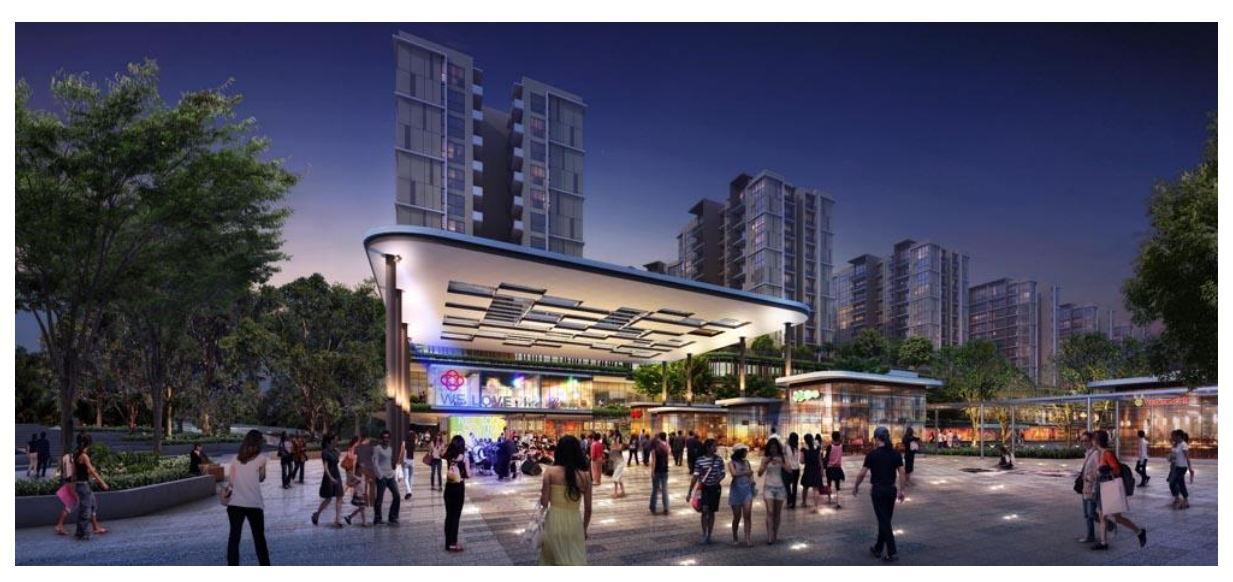
Northpoint City set to be key gathering spot for community, with large areas set aside for community activities.

The Nee Soon Central Community Club will move into the South Wing of the mall by 2018 and will be the first Community Club in Singapore to be housed in a shopping mall. The Yishun Public Library will also be re-opening in the mall by the first quarter of next year.