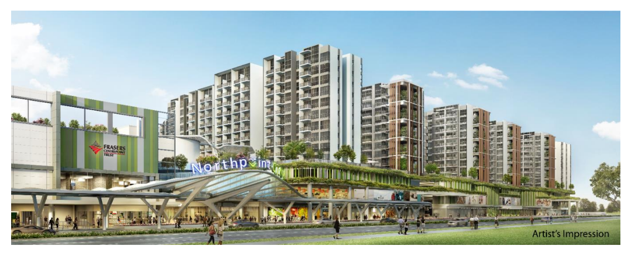
Artist's impression of Northpoint City

SINGAPORE , JULY 25 , 2017 – The largest mall in Northern Singapore will open to shoppers in the fourth quarter this year. Developed by Frasers Centrepoint Singapore, the mall is part of Northpoint City, the largest integrated development in the North, housing over 400 retail and dining outlets across two retail wings. When completed, the 1.33 million square feet Northpoint City will also include the 920-unit North Park Residences, community spaces, an air-conditioned bus interchange and an underground retail link with direct access to Yishun MRT Station.