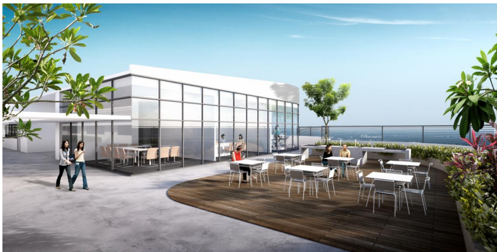
Artist's Impression of Sky Lounge

Located along Woodlands Ave 12 at approximately 10 minutes' walk from Admiralty MRT Station, this new industrial complex is near to the future Woodlands South MRT station of the proposed Thomson-East Coast line, the Woodlands Regional Centre and the Causeway. The site's location offers excellent transport connectivity via Seletar Expressway and the future North-south Expressway.