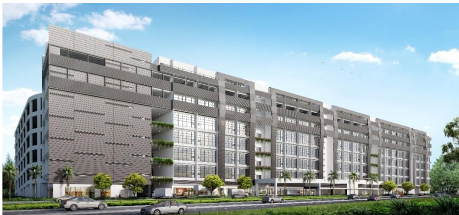
Artist's Impression of MEGA@Woodlands

This industrial complex is a modern eight-storey ramp-up/flatted industrial building for B1 clean and light , and B2 general industry comprising 517 units, each from 1711 sq ft.