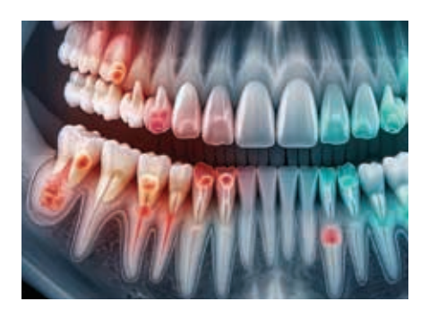
Illustration of Dental Imaging Diagnostics

As we structure our company to providing turn-key supply chain solutions and complementary digital, Al and robotics solutions, we will continue to build strong working relationships with our suppliers and academia to strategically enhance our presence in the area.