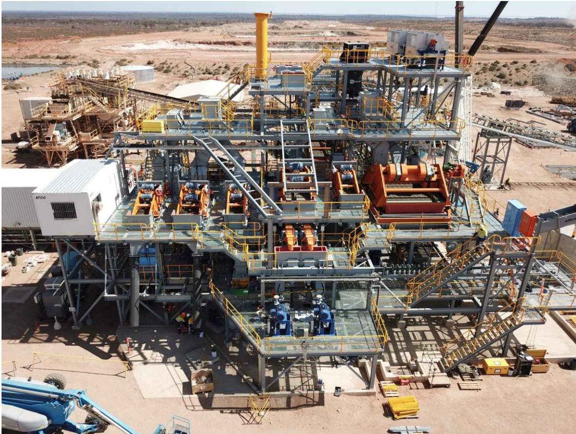
Figure 3 | DMS Plant – December 2017