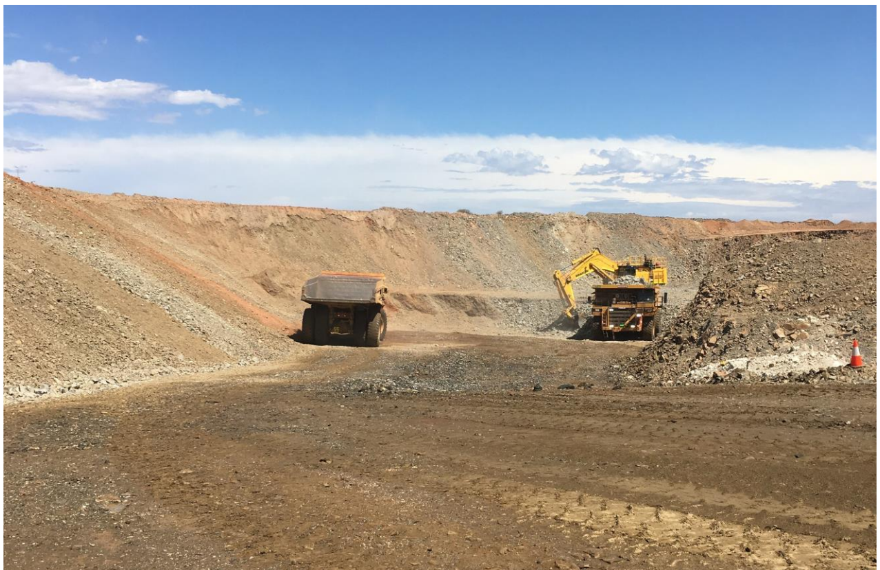
Figure 6 | Truck loading – January 2018