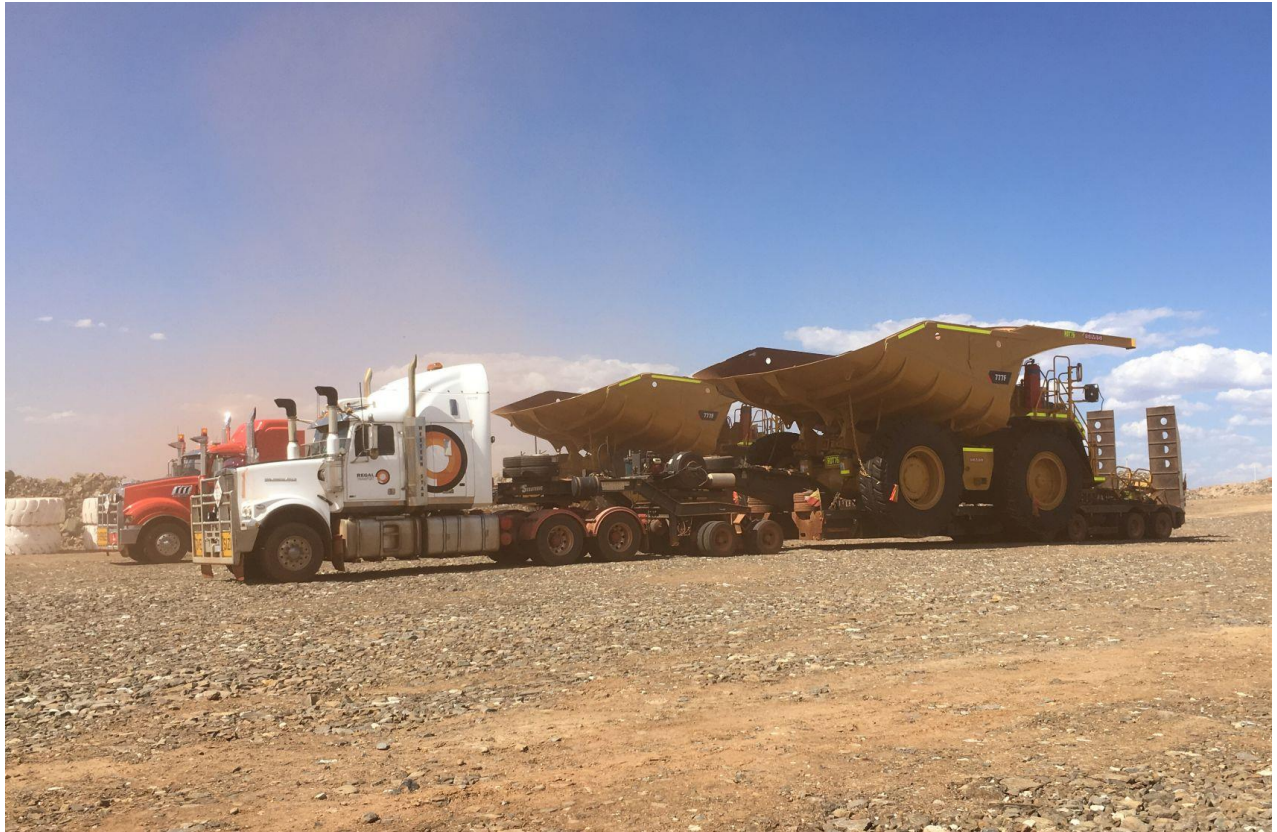
Figure 5 | Arrival of mine trucks – December 2017