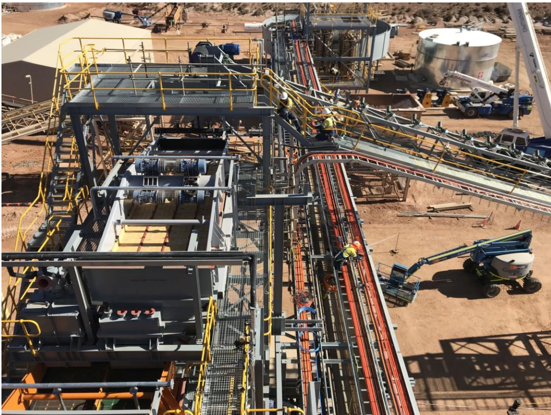
Figure 4 | Piping and Electrical Work – January 2018