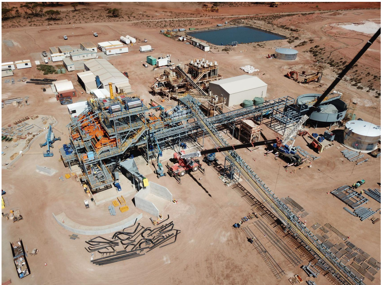
Figure 2 | Plant overview (DMS in foreground) - December 2017