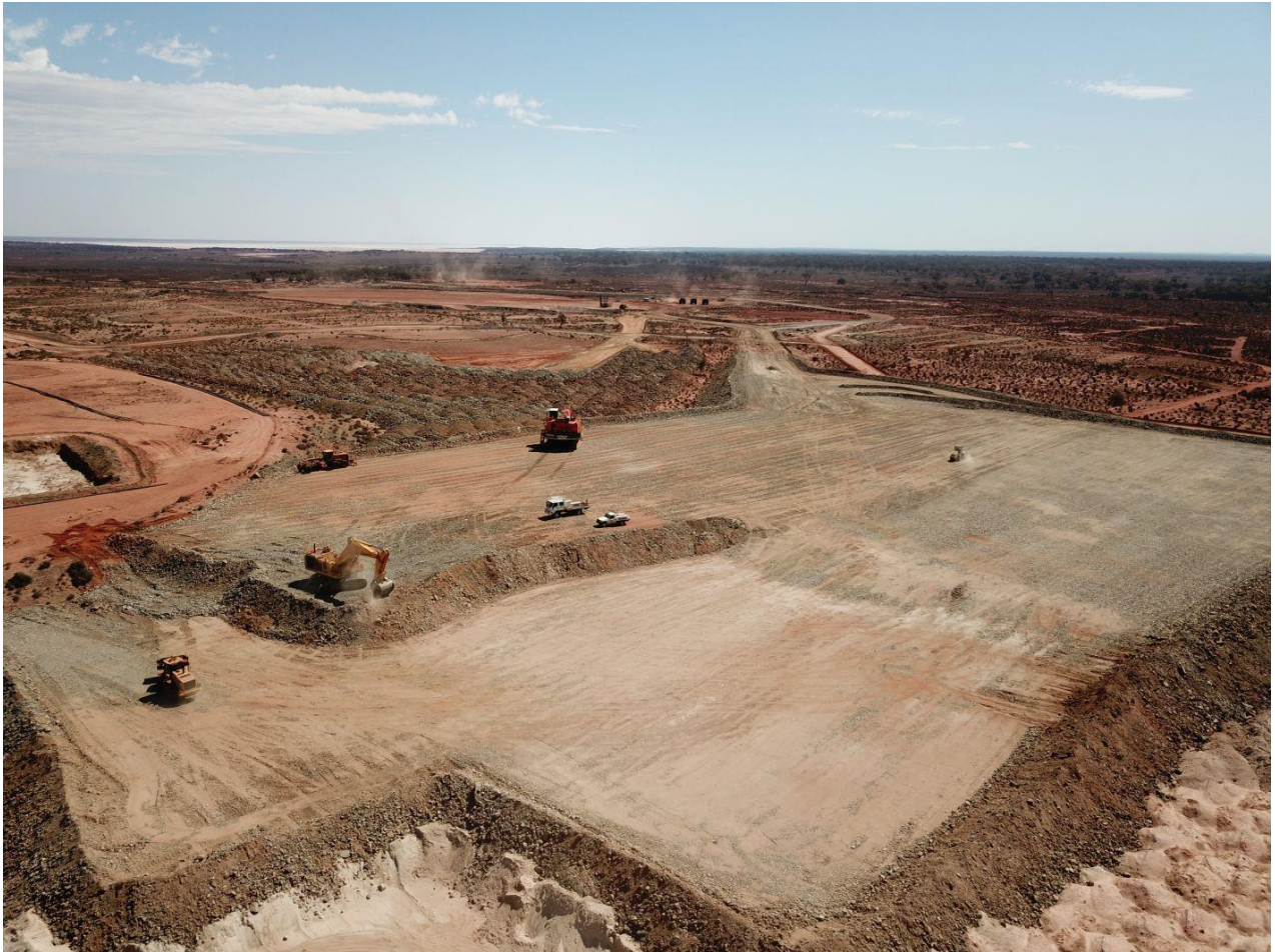
Figure 7 | ROM and crusher pad – December 2017