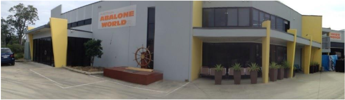
BNY's 800 square-metre processing plant and duty free shop in Gold Coast, Australia

Established in Gold Coast, Queensland, in 1999, BNY 's abalone processing plant is the only First Class Australian Quarantine Abalone registered with the highest Grade A Processor Establishment awarded by the Australian Quarantine and Inspection Service (AQIS). BNY is amongst four Australian companies allowed to export canned abalones overseas and the only one licensed to export canned abalones to the PRC 1 .