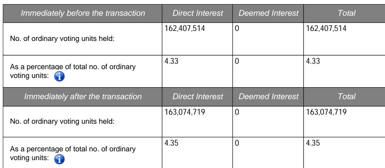
Table 1. Change in respect of ordinary voting units of Listed Issuer