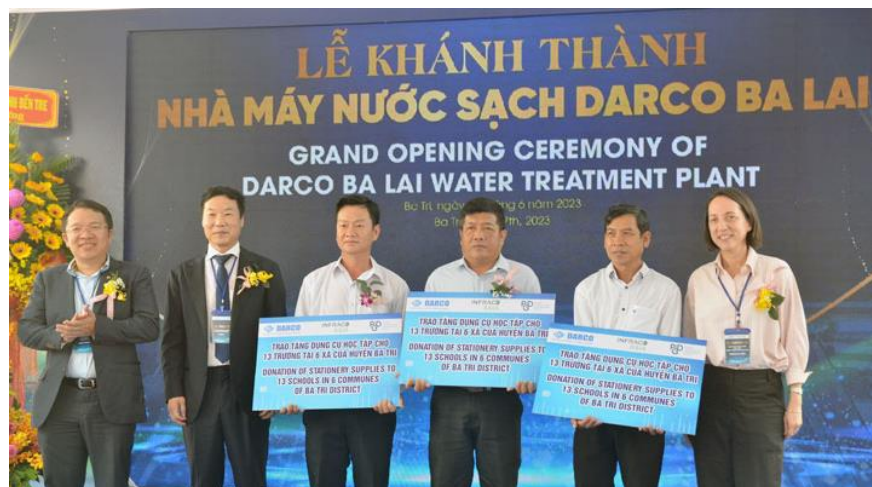
Darco Ba Lai's donation of stationery supplies to 13 schools in 6 communes of Ba Tri District