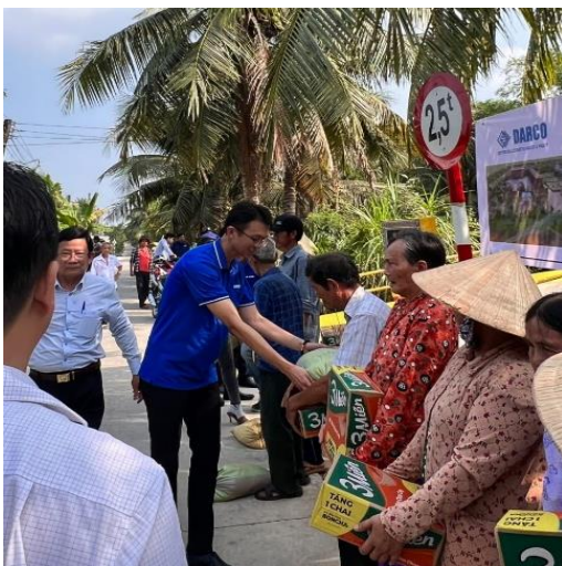
Contributing to the local community