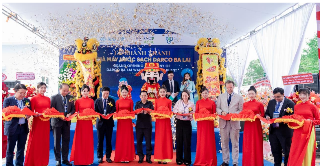
Grand opening ceremony of Darco Ba Lai Water Treatment Plant

The project has a 50-year lease from the Vietnam government commencing July 2017. According to the World Bank’s Global Partnership for Results-Based Approaches ( www.gprba.org ), approximately 74% of the Vietnamese population is concentrated in rural areas, yet only 48% of households have access to clean water and must rely on polluted sources for basic household needs during the dry season.” On 3 January 2022, Deputy Prime Minister, Mr Le Van Thanh, signed a decision approving the National Rural Clean Water Supply and Sanitation Strategy to supply 65% of rural residents with affordable clean water by 2030, and 100% of all rural residents by 2045. ( https://en.vietnamplus.vn/national-strategy-aims-to-provide-clean-water-to-rural-residents-by-2030/220029.vnp#&qid=1&pid=1 )