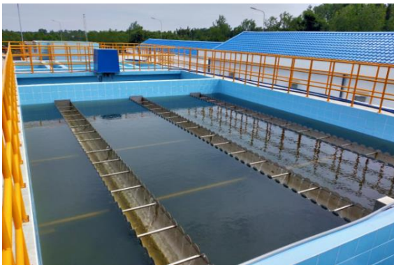
Darco Ba Lai Water Treatment Plant