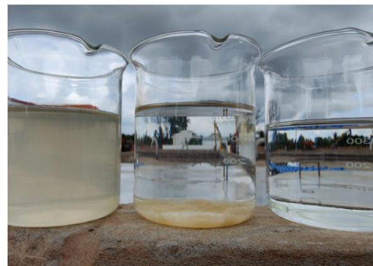
Water before and after treatment