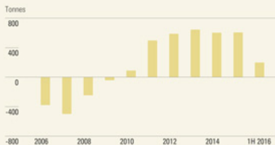
Figure 4: Central Bank Net Sales and Purchases of Gold in Tonnes