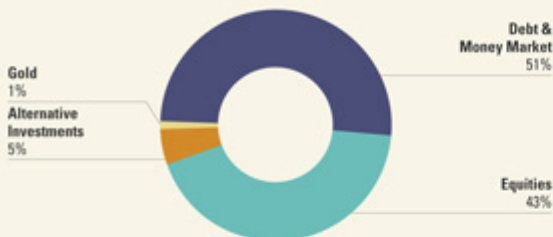
Figure 5: Size of Financial Markets US $160 Trillion; June 30, 2015*

Source: BIS, Thomson Reuters GFMS, Hedge Fund Research, Preqin, World Federation of Exchange, World Gold Council. As of June 30, 2015.