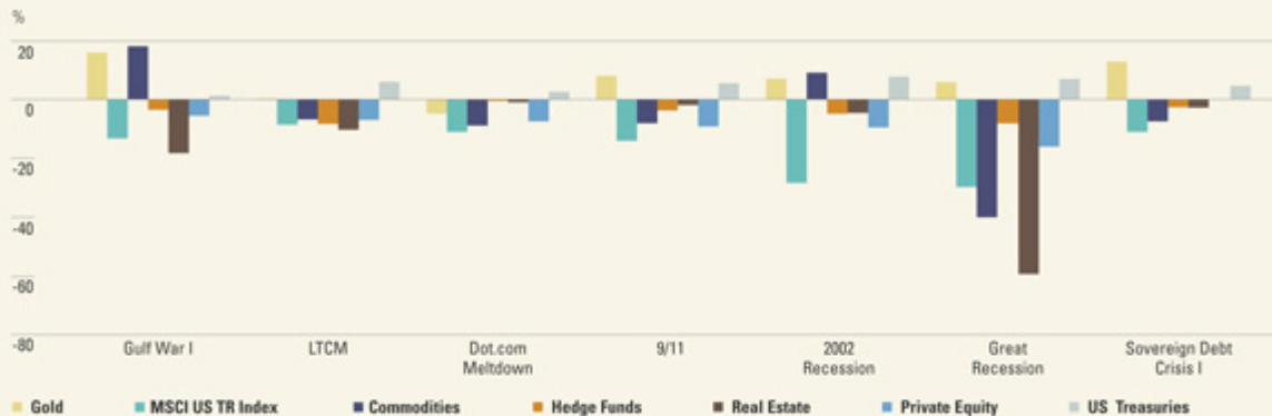
Figure 2: Gold as a Tail Risk Hedge – Performance in Market Downturns