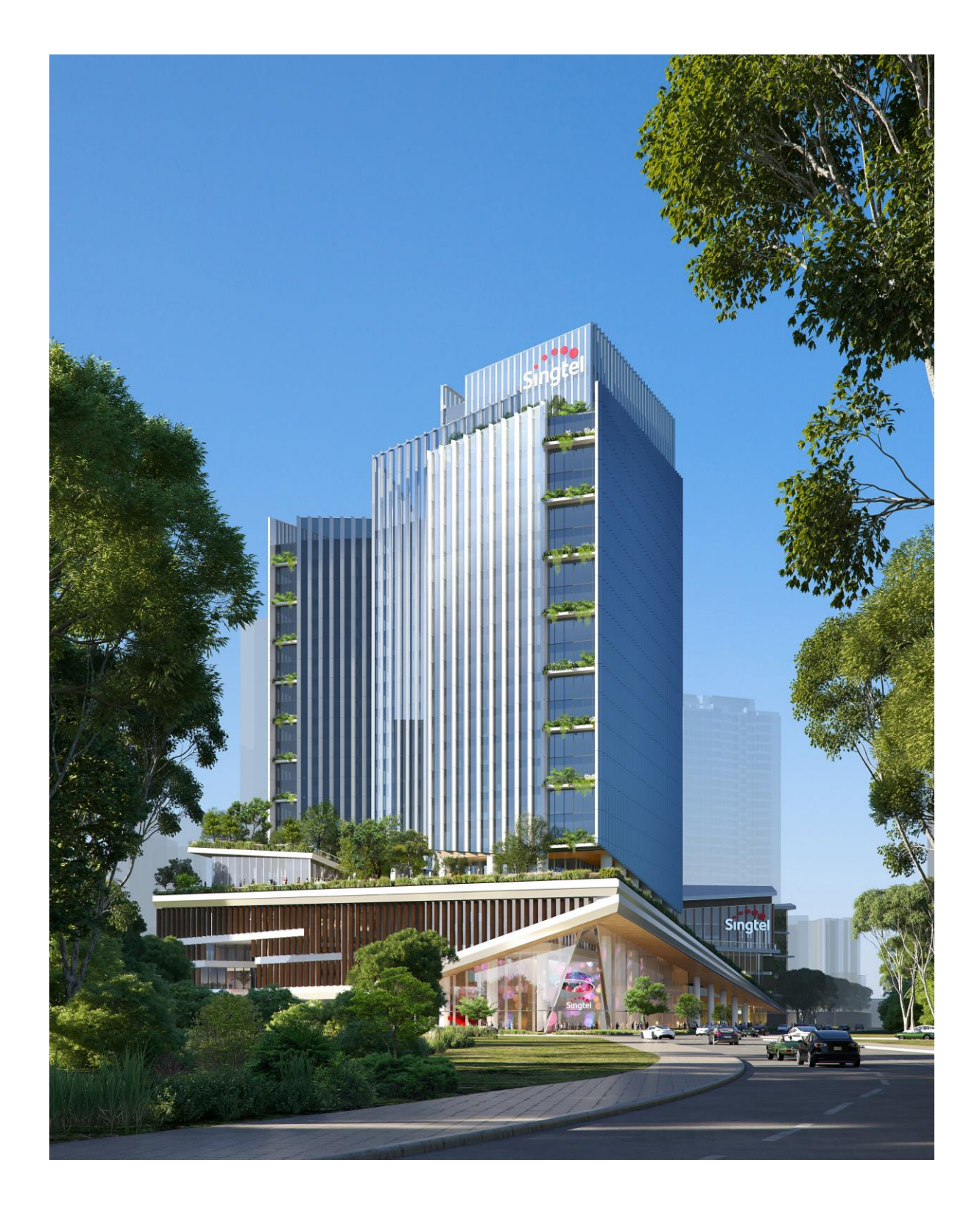
Artist's impression: View of the new Singtel Comcentre from Eber Road. Pictures are illustrations and the design may change as the development progresses.