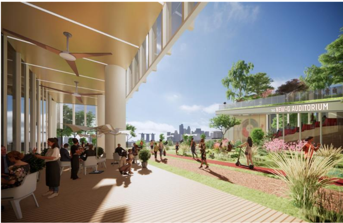
Artist's impression: 'Innovation Park' with a view of the city. Pictures are illustrations and the design may change as the development progresses.