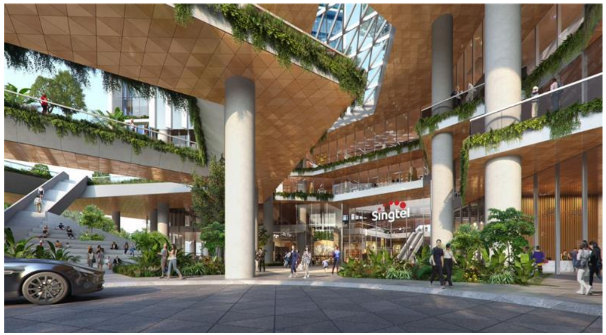
Artist's impression: Grand arrival experience. Pictures are illustrations and the design may change as the development progresses.