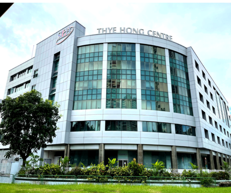
Thye Hong Centre, a newly acquired development property in FY2021

In the second quarter of 2021 ("2Q 2021"), prices of private residential properties increased by 0.8%, compared with the 3.3% increase in 1Q 2021 1 . This marked the fifth straight quarter of rising property prices amid strong demand for housing during the pandemic.