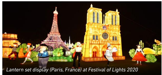
Lantern set display (Paris, France) at Festival of Lights 2020