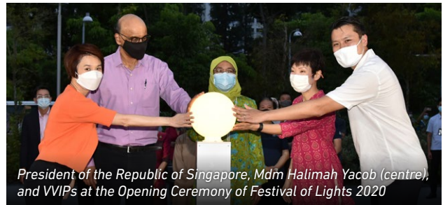
President of the Republic of Singapore, Mdm Halimah Yacob (centre), and VVIPs at the Opening Ceremony of Festival of Lights 2020

A-Smart Media Pte Ltd, the Group's wholly-owned subsidiary, continues to front efforts in Corporate Social Responsibility. Since organizing its maiden event in January 2017 for the President's Challenge Charity Fund, A-Smart Media has since gone on to organize multiple events and functions, ranging from concerts to business and marketing conferences to even large-scale outdoor events. The recently concluded Festival of Lights 2020, a large-scale outdoor event that was held at Jurong Lake Gardens, featured an unprecedented 28 sets of large lanterns amidst the Covid-19 pandemic. The event was widely reported as a great success