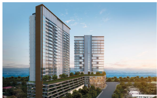
Artists impression of Timor Marina Square

In March 2019, Timor Marina Square S.A., in which the Group owns 69% as at 31 July 2021, entered into an agreement to develop two blocks of mixed development properties (23-storey and 19-storey respectively), comprising retail, office, serviced apartments and luxurious residential apartments, in Timor-Leste.