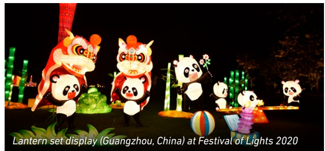
Lantern set display (Guangzhou, China) at Festival of Lights 2020

on different local media platforms in Singapore. Its Safe Management Measure (SMM) model was also extensively emulated by different event organizers subsequently.