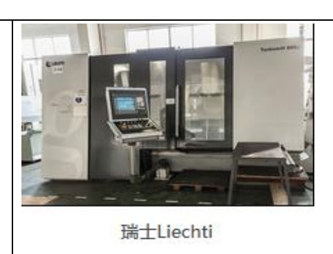
Figure 2. Products and specialized precision CNC machines