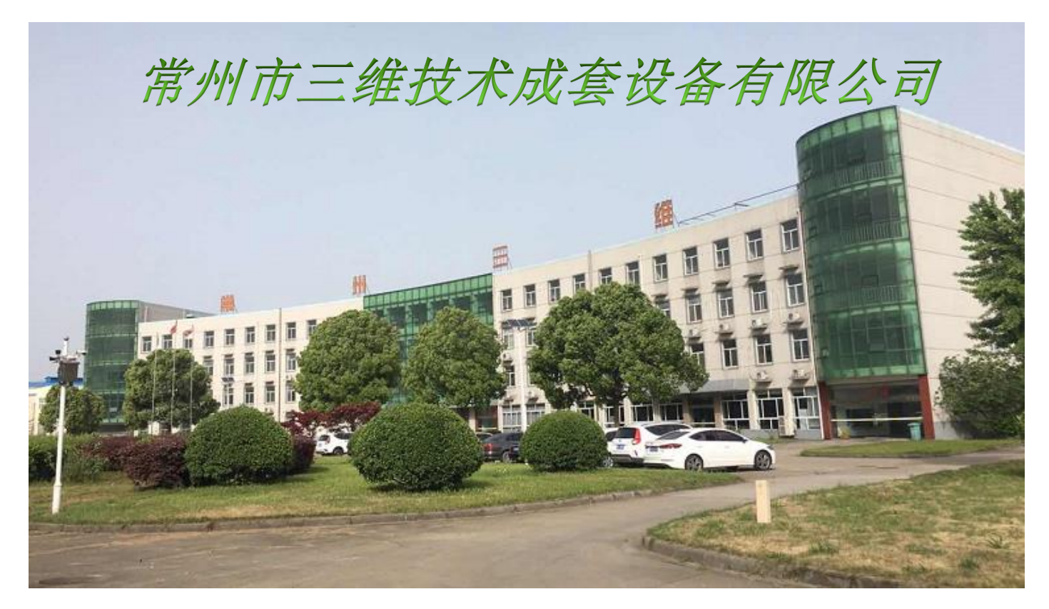
Figure 1. Main Building of Changzhou 3D Technological Complete Set Equipment Co., Ltd, wholly owned subsidiary of STE