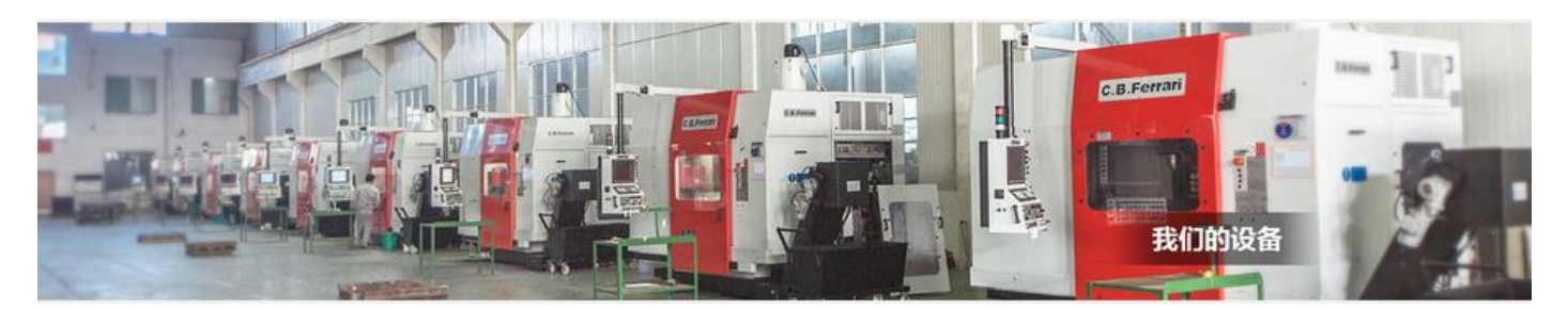
Figure 4. Main specialized CNC machineries

China's economy was the first to be hit by the COVID-19 outbreak, the first to be locked down, and the first to begin an economic recovery. We would examine the impact of the COVID-19 crisis on China's GDP growth using a set of alternative growth indicators. 2020 was full of challenges brought about by the Covid-19 pandemic. We had devoted a lot of our resources to regain our key clients' confidence in CZ3D's capabilities. The entire sales and production processors had been enhanced with the ultimate intention to increase customer satisfaction in all areas. As such, we have been reinforcing our pool of skilled workers and sourcing new talents through on-job training.