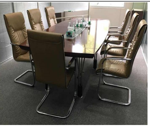
Figure 5 Two Meeting Rooms used by the Sustainability Working Committee for discussion