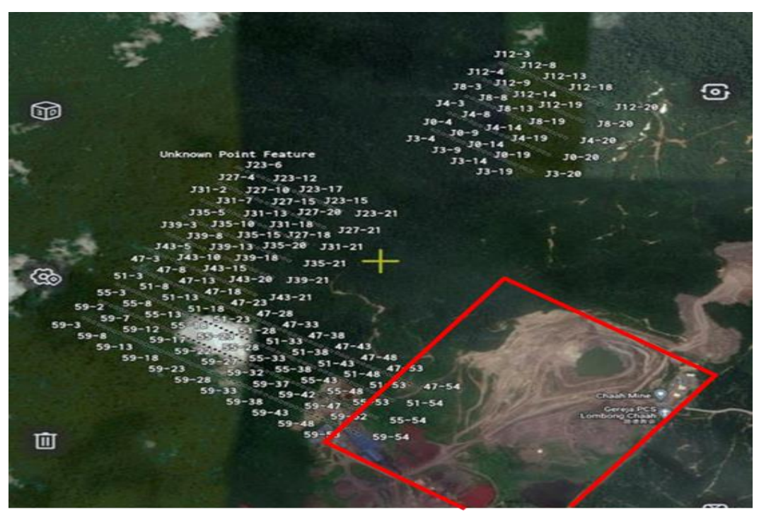
Figure 3: Airborne survey location shown on the google image which covering the adjacent Lot 3533