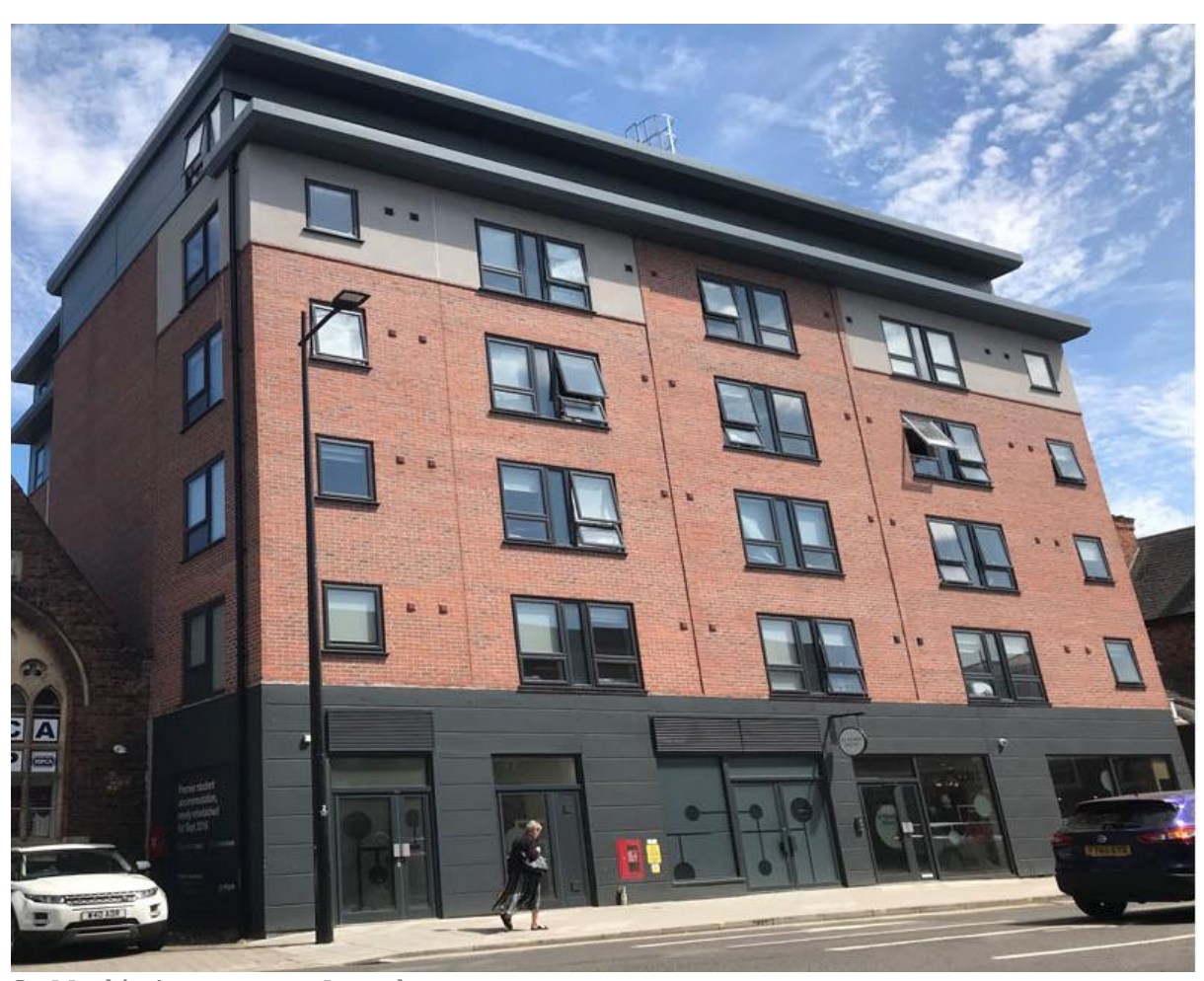
St. Mark's Apartments, Lincoln