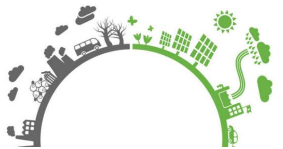
Page | 2

We are committed in upholding good governance and sustainable development, and we will continuously report on our progress annually. We are also committed to listening to our stakeholders and we look forward to your feedback. For any enquiry relating to this report, please contact us at <a href="mailto:invest@chaswood.com.my">invest@chaswood.com.my</a>.