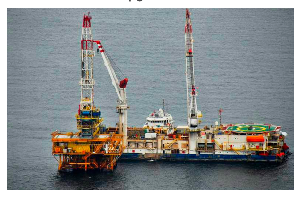
MTR-2 (Built in 1981 and upgraded in 1997 and 2007)

The 'MTR-2' is a tender assist drilling rig also with an extensive service record. It is uniquely characterized by its light weight drilling package that is suitable for light weight platforms in the South East Asian region. In addition, it has the ability to deliver fast rig-up time for its drilling package compared to other tender rigs thus offering cost savings to oil and gas majors. It also has an excellent track record for efficiency, safety and reliability and has completed several successful campaigns in Thailand and Indonesia. This rig is ideal for drilling on light weight platforms in South East Asia and West Africa and has a water depth rating of 100 meters on conventional mooring and 680 meters on pre-laid mooring, a drilling depth rating of 5,500 meters and accommodation for 126 personnel. The 'MTR-2' is ABS classed and flies the Thai flag.