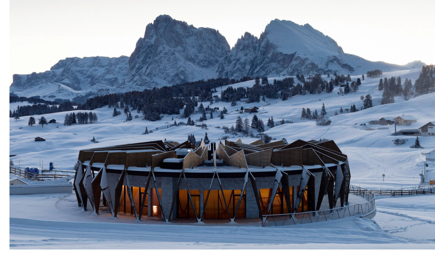
Alpina Dolomites, Italy