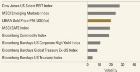
Figure 4: Gold's Volatility Tends to be Lower than Certain Equities

Data from 01/31/07 to 01/31/17 reflect annualized monthly averages for 120 months. Past performance is no guarantee of future results.