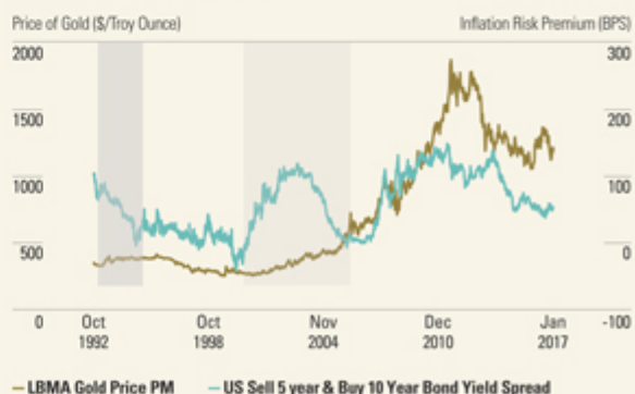
Figure 1: Inflation Risk Premium & Price of Gold Don't Always Move in Lockstep